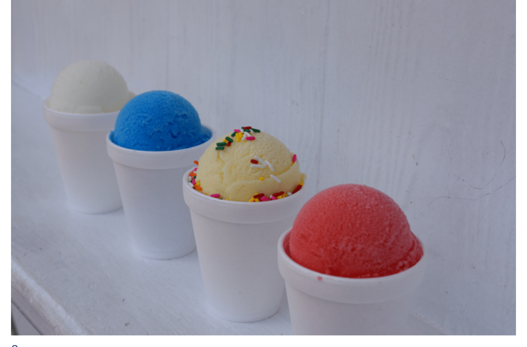
<u>Save</u> Cool off with a cup of sorbet or Italian ice at <u>Doodle's</u>, a Cahaba Heights family favorite.